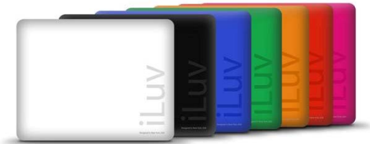
iCC801 Silicone Case in a variety of colors – Retail $24.99