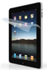
iCC1190 Clear Protective Film– Retail $14.99