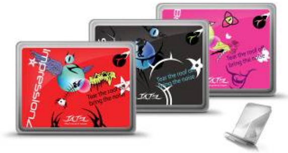
iCC804 Ultra Thin Case with Tatz Graphics in pink, red or black– Retail $34.99