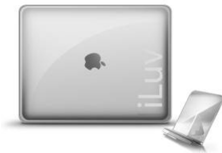
iCC803 Ultra Think Clear Case – Retail $29.99