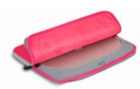
iBG2000: A water resistant neoprene sleeve for iPad available in a variety of colors and designs - $19.99