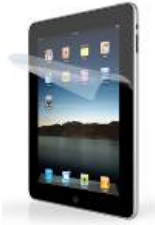
iCC1191 Glare-free Protective Film– Retail $19.99