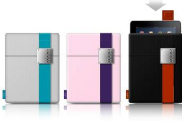
iCC805 Casual Fabric Case with Band Holder in three color options– Retail $39.99