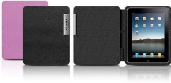
iCC806: Leather Case available in black or pink– Retail $39.99

The iLuv line of fashion designed cases made in a variety of material and color options for iPad will include: