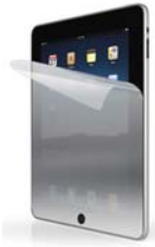
iCC1192 Mirror type Protective Film– Retail $19.99